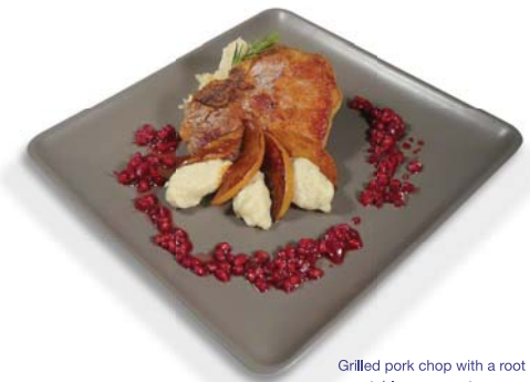
Grilled pork chop with a root vegetable puree, nutmeg gnocchis finished with a pomegranate jus and caramelized apples.