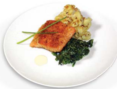
Panko encrusted atlantic salmon sautéed, served on creamed spinach pernod and a macaroni and bleu cheese timbale then finished with a soft riesling sauce.