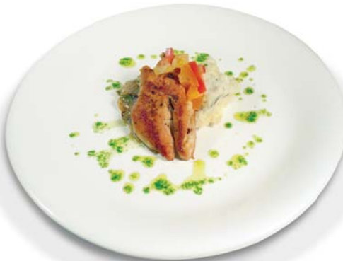
Oven roasted bone in chicken served on caramelized Belgian endive and horseradish mashed potatoes topped with an assortment of heirloom tomatoes concasse, and fresh chive oil.

Whether you require a prepared lunch for drop off, a meal with full service wait staff, or a simple, elegant appetizer party, Chef Marcel Fine Catering can help with your corporate event. We know how important it is to keep your employees and clients happy, and providing them with good food and cordial service will show them you cared enough to provide the best. We look forward to working directly with your event coordinator to ensure that both the menu and event details are designed to your exact specifications.