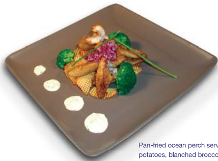
Pan-fried ocean perch served on gaufrette potatoes, blanched broccoli accompanied with a boursin sauce topped with red onion marmalade.